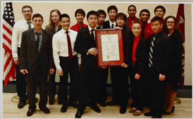
Stony Brook University Colony members