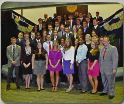
National officers and Nu Delta Chapter members.

Service has been an integral part of our chapter from the very start. Having so many individuals that have been affected by cancer both directly and indirectly, we have been in the top two contributing teams to the annual Relay for Life fundraiser at the University of Pittsburgh. We believe that in giving back to others, the individual giving his or her time and effort benefits just as much as the receiver. We also believe in giving back to various demographics in order to encourage diversity in our brothers. In the past, these events have