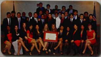
Omicron Delta Chapter members

Omicron Delta Chapter would like to thank all of those who attended the installation, especially the brothers from other chapters who braved the massive snowstorm that shut down three NYC airports. We would also like to thank all of those who made this special day possible, including the Theta Tau national officers and our very own alumni. We look forward to beginning our journey as a proud chapter of Theta Tau.