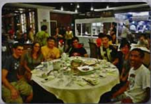
First Flight Dinner at Quon In De Roasted Duck in Beijing, CN.