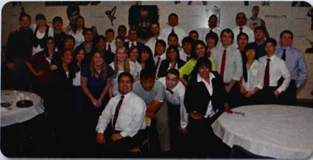
Brothers like to dress up a little while eating or serving crab

As a brand new chapter, we are determined to be an active force in driving positive changes on our campus and in our community. In pursuit of this goal, we hosted our largest event ever on Saturday, February 9. The primary purpose of the Benefit Crab Feed and Silent Auction was to promote and aid the Prep USA – Reach for the Stars Academy here in Stockton, California. Here is an excerpt from the event program: