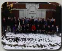
Miami University Colony members

Along with our plans for community and charity services, the Miami University Colony of Theta Tau is also looking forward to expanding socially. Recently members attended a Theta Tau formal hosted by Iota Gamma Chapter at the University of