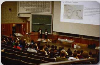
Top right: Omicron Gamma members and the prize wheel. Right: Recruitment chairs describing Theta Tau at an event.