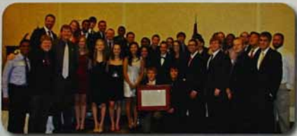
Xi Delta Chapter members

potential new members, the sky seems to be the limit.