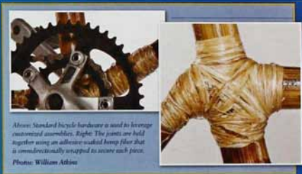
Above: Standard bicycle hardware is used to leverage customized assemblies. Right: The joints are held together using an adhesive-waxed hemp fiber that is circumferentially wrapped to secure each piece.