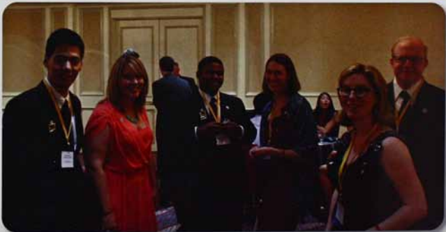
Alumni reception at 2012 National Convention.

If you are interested in joining the National Alumni Club, volunteering to help the National Alumni Club in any capacity, or have any ideas or comments, please contact us at nac@thetatau.org !