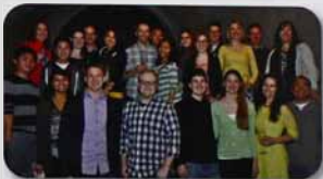
Alumni Club outing to Sonoma.

The National Alumni Club is energized for the new biennium. In the past year we have had increased involvement from our Regional Alumni Representatives who are attending Regional Conferences to interact with alumni, and we aim to build on this progress by hosting smaller regional alumni events more frequently throughout the year. There are also plans to improve the interaction between other alumni clubs and help new alumni clubs get started.