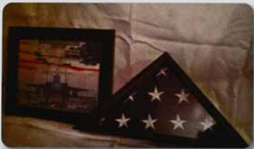
Certificate of Appreciation and flag flown in combat by the 336th Expeditionary Fighter Squadron recognizing donations to the troops in Afghanistan.