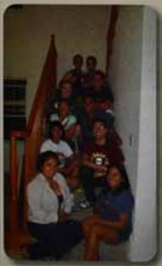
After a long day at Meet and Greet, brothers from Lambda Delta and Mu Delta relaxed at a member's house.

At the University of California, Merced, Mu Delta Chapter started the school year with a lighthearted meeting followed by serious planning – it is that time of the semester where we are focused on recruiting new members. On the first day of our big recruitment week, Lambda Delta Chapter (University of the Pacific) surprised us with a visit to help us clean for our Meet and Greet event. They arrived after the event ended, but we were still able to bond, connect, and exchange information. We enjoyed spending time with our brothers from Lambda Delta Chapter, and thank you to everyone who came to visit us! We appreciate the support they offered, and we hope more chapters will do the same for those near them – a surprise visit to lend a hand to another chapter can lead to a stronger brotherhood.