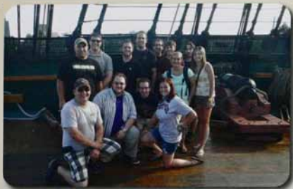
Convention attendees visit the USS Constitution.