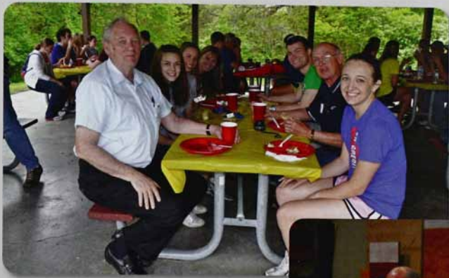
Members and alumni interact at the Dad Perry Park cookout