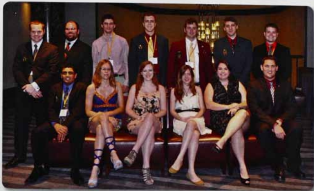
Rho Chapter brothers and guests at the National Convention in Boston.

in St. Baldrick's managed to raise close to $1900. Additionally, our donations from last year of gifts and cards to the troops in Afghanistan were recognized by a certificate of appreciation to the Chapter, Little Sisters, and Alumni Club, and a flag flown in combat by the 336th Expeditionary Fighter Squadron.