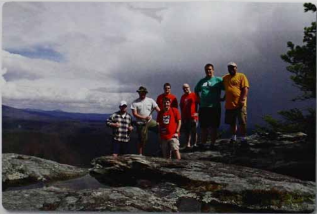
Alumni camping trip.