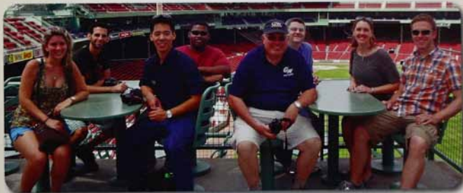
2012 Convention attendees tour Fenway Park.