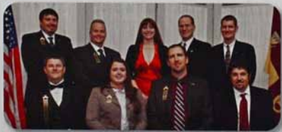
2012-14 Executive Council.

The rest of the Executive Council and I are excited about the upcoming biennium, and we look forward to working with you all. I hope to see you at an upcoming chapter installation, alumni event, Habitat for Humanity spring break, or at next summer's Leadership Academy.