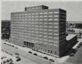
Present headquarters: The Adams Building