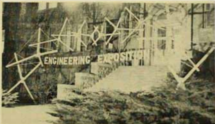
Zeta's Exposition Archway