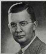
Engineering & Mining Journal