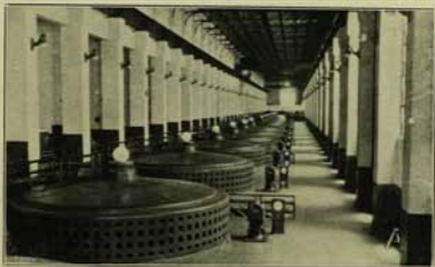
INTERIOR OF POWER STATION—GENERATOR FLOOR

The principal cities served with Keokuk power are Burlington, Galesburg, Monmouth, Ft. Madison, Keokuk, Quincy, East St. Louis, and St. Louis.