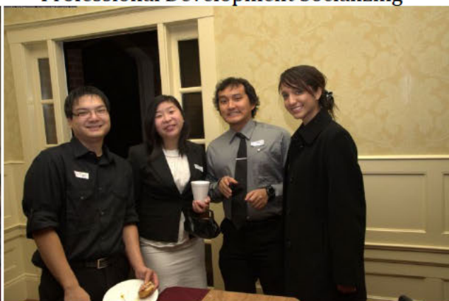
Professional Development Socializing