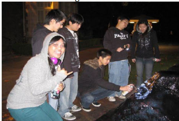
Painting the Rock