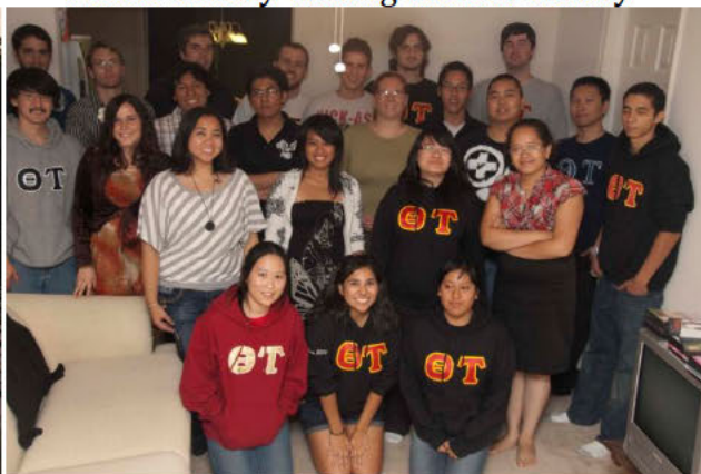
Pacific Colony visiting Merced Colony