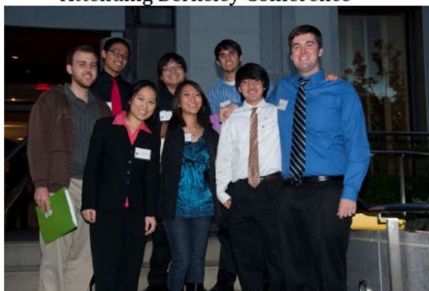
Attending Berkeley Conference