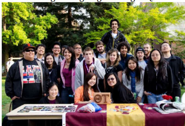
Tabling during EngineeringBBQ