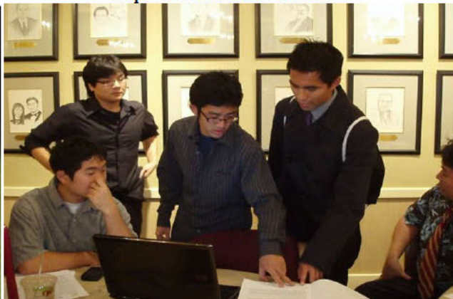
Alpha Rush Interviews