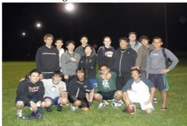
Flag Football Team