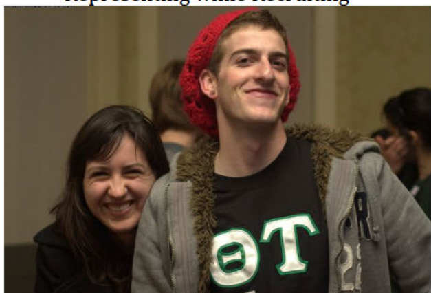
Representing while Recruiting