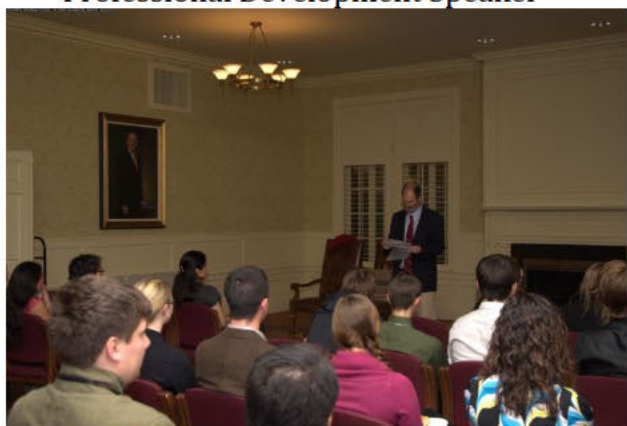
Professional Development Speaker