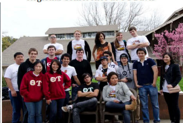
Regional Conference at UC Davis