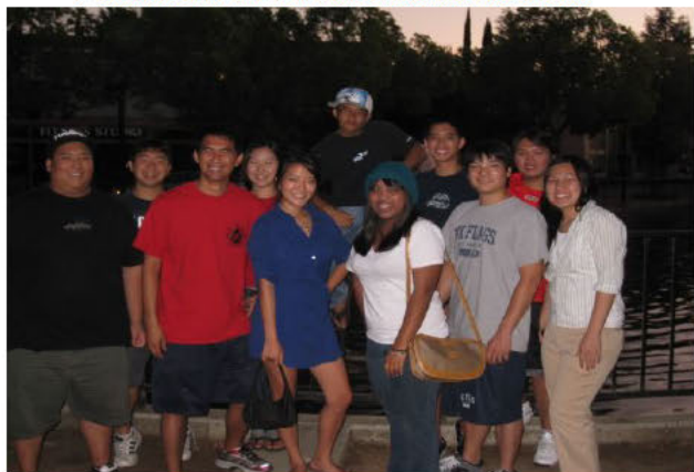
Founders on Brotherhood Retreat