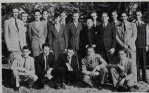
Left to Right:

The greatly increased enrollment in engineering this year makes it possible for us to choose for pledges a larger number of outstanding students, and our pledges at the