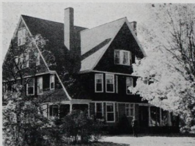
Beta Chapter House