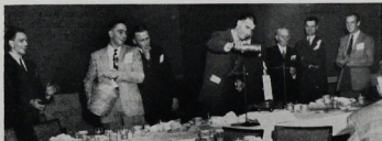
Alpha Chapter's Founders' Day Banquet "Burning the Mortgage"

Now with the important initiation of honorary members and the Founders' Day ban-